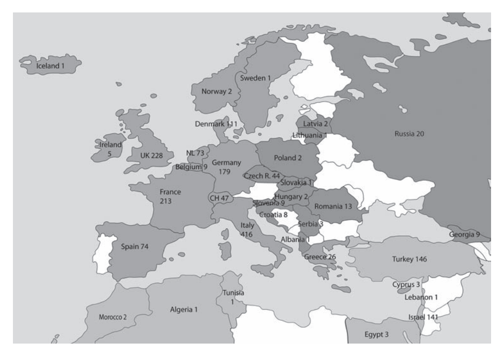
Figure 1 Distribution of patients according to the country of residency in Europe and the Mediterranean region. Other patients living in Saudi Arabia (33), Argentina (23), Australia (11), India (5), Oman (4), Kuwait (3), Guadalupe (2), Uruguay (1) and Martinique (1) are also reported.